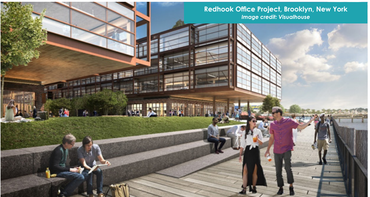
Redhook Office Project, Brooklyn, New York