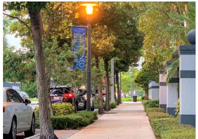
Flagler Village.