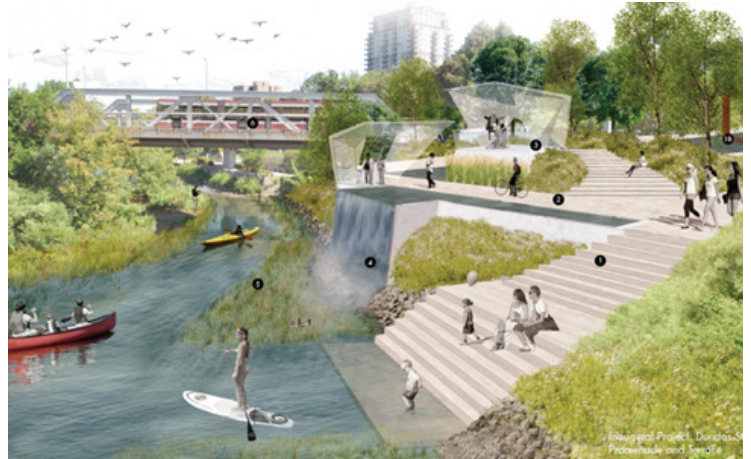
Inaugural Project: Dundas Street Promenade and Terrace, London, Ontario, Canada.