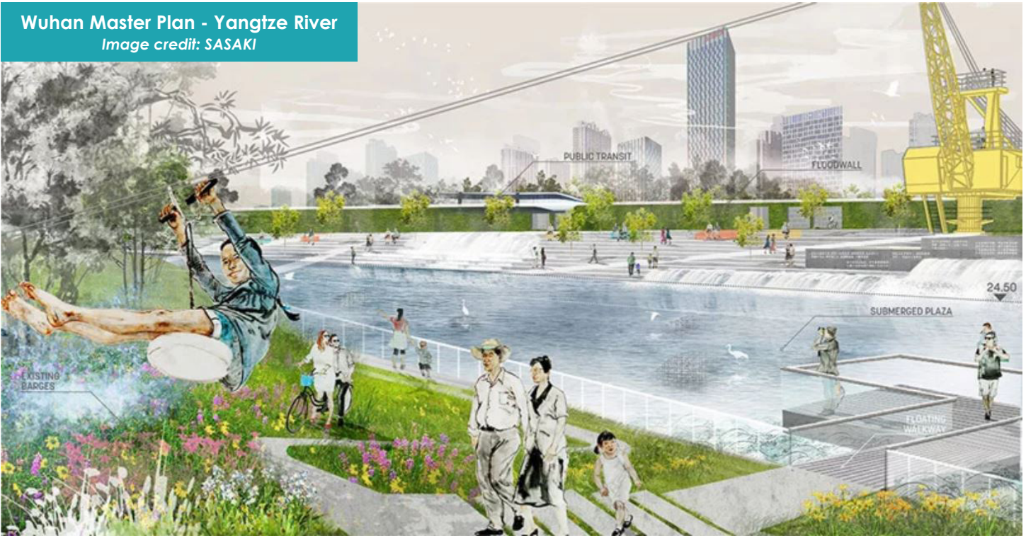
Wuhan Master Plan - Yangtze River

POLICY UD 1.2.3b: Incorporate guidelines for adapting transitions at the ground level with regards to flood prone areas, such as greater floor to ceiling heights, adaptive ground level floors and other adaptive design strategies.