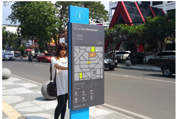
Gateway and Wayfinding Signage.

POLICY UD 3.4.2: Establish a sign amortization program to reduce the clutter of large signs and billboards along major streets.