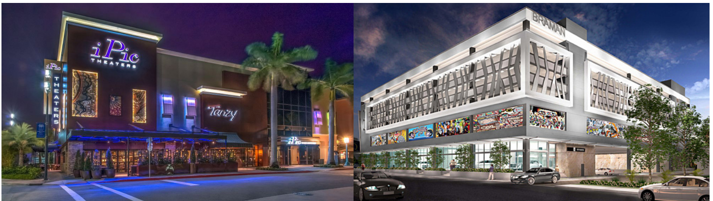
High quality building design, illumination features, and parking garage screening.

Sources: www.wptv.com/news/region-s-palm-beach-county/delray-beach/new-ipic-theater-opening-soon-in-delray-beach & www.thebocavoice.com/live-magic-shows-ipic-blake-vogt/