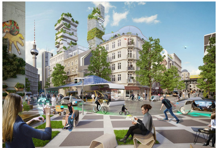
Urban Futuristic Living and Mobility.