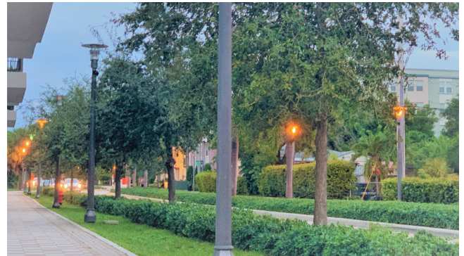
Street Trees, Fort Lauderdale, Florida

POLICY UD 3.2.6b: Encourage street trees, whether planted as part of a public project or associated with private redevelopment, provided the species and locations are appropriate based on context and approved by the agency with jurisdiction over the right-of-way.