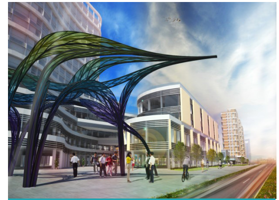
Area of Respite/Public art.

POLICY UD 2.2.5: Public gathering spaces along waterfronts, including promenades, viewpoints, marine facilities, and parks should be designed to promote continuous public access and views to the waterfront.