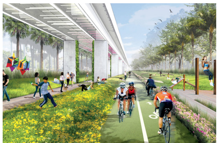
The Underline, Miami, Florida.