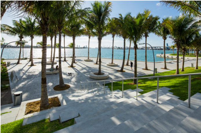
Miami Museum Park, Baywalk, Miami, Florida.

POLICY UD 4.4.1b: Ensure that the design of each waterfront site responds to its unique natural qualities. New buildings should be carefully designed to consider their appearance from multiple vantage points, both in the site vicinity and at various points on the horizon.